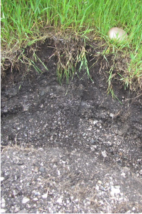
Figure 1: Shell Middens. These middens can extend into the intertidal zone in areas that have undergone sea level rise during the precontact period.