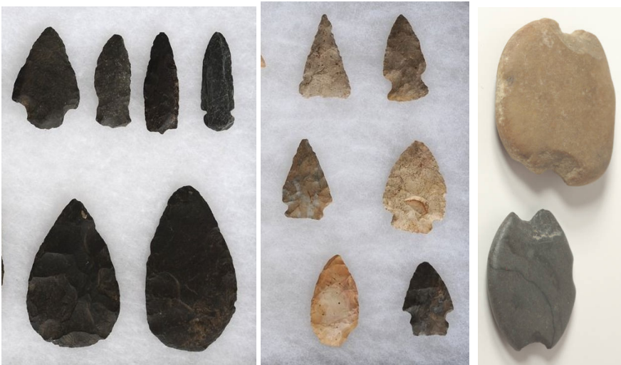
Figure 3: Examples of stone flakes (left) and a stone core that is a source of flakes (right) from archaeological sites.